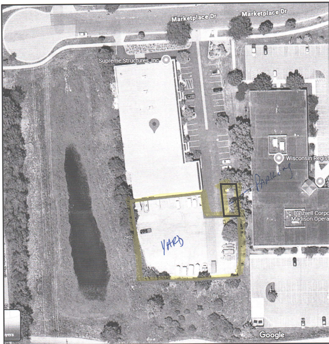
Exhibit B Yard & Parking 2906 Marketplace Drive